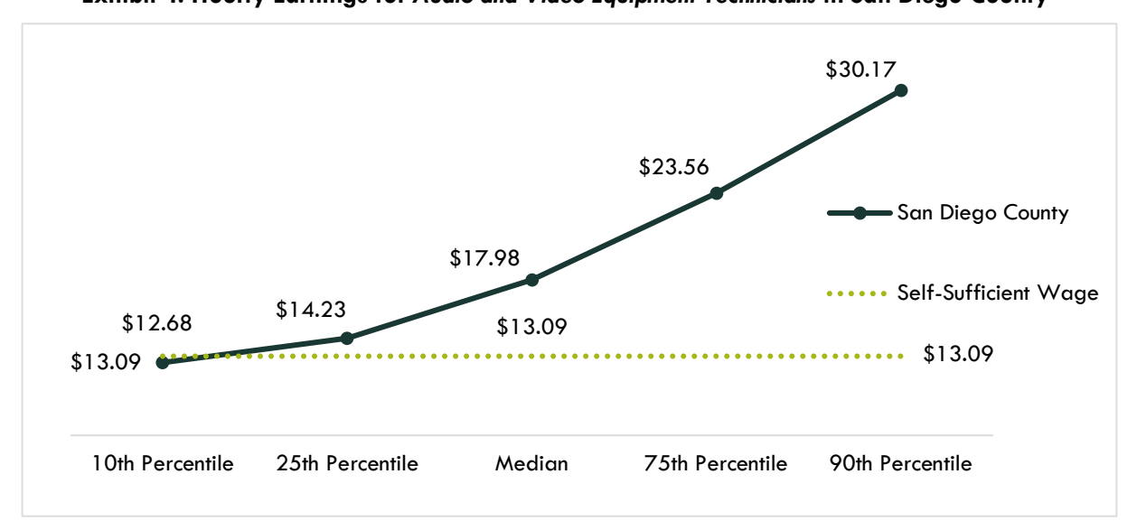
Exhibit 4: Hourly Earnings for Audio and Video Equipment Technicians in San Diego County<sup>5</sup>

Audio and Video Equipment Technicians earn median hourly earnings of $17.98, more than the Self-Sufficiency Standard for a single adult in San Diego County, which is $13.09 per hour (Exhibit 4).<sup>4</sup>